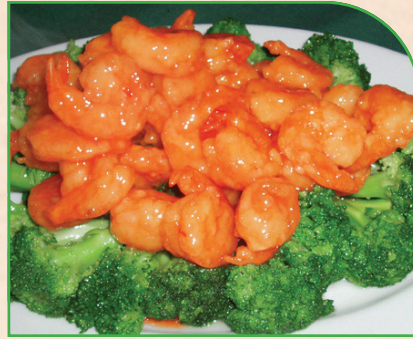
滑溜炒蝦 “Famous” Slippery Shrimp (Crispy Shrimp in Light Batter, Sautéed w/Ginger and Light Sweet & Sour Spicy Flavor Sauce) $24.95