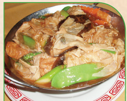
鮮腐皮羅漢齋 Supreme Mixed Vegetables $20.95