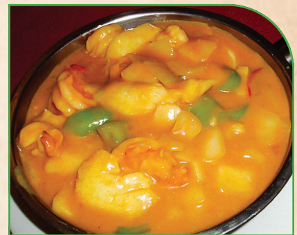
咖喱海鮮豆腐煲 Mixed Seafood & Fried Tofu with spicy Curry Sauce 🌶️ $24.95