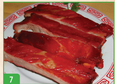
7 B.B.Q. Spareribs