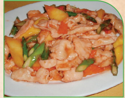
芒果利筍雞片 Mango Chicken $20.95