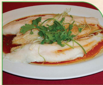
薑蔥蒸魚片 Steamed Fish Fillet w/House Special Soy Sauce $25.95