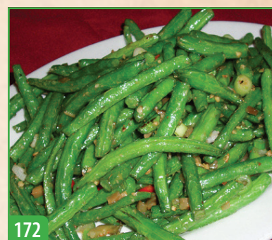
172 Hot Braised String Beans (Meatless)