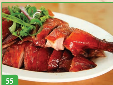
Crispy Deep Fried Chicken