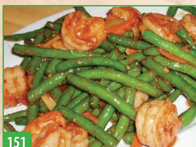
Sautéed Shrimp w/ yellow Nira & Snow Peas