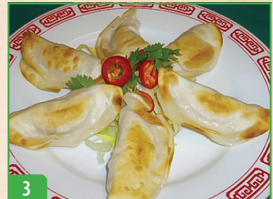
3 Pan Fried Dumpling