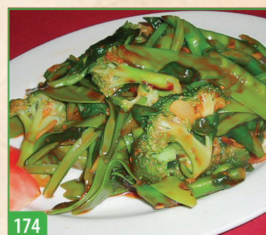
174 Sautéed Fresh Mixed Vegetable w/Spicy Garlic Sauce