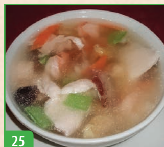
25 Assorted Wor Wonton Soup