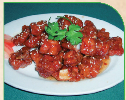
芝麻蜜汁排骨 Sesame Honey Garlic Spareribs $20.95