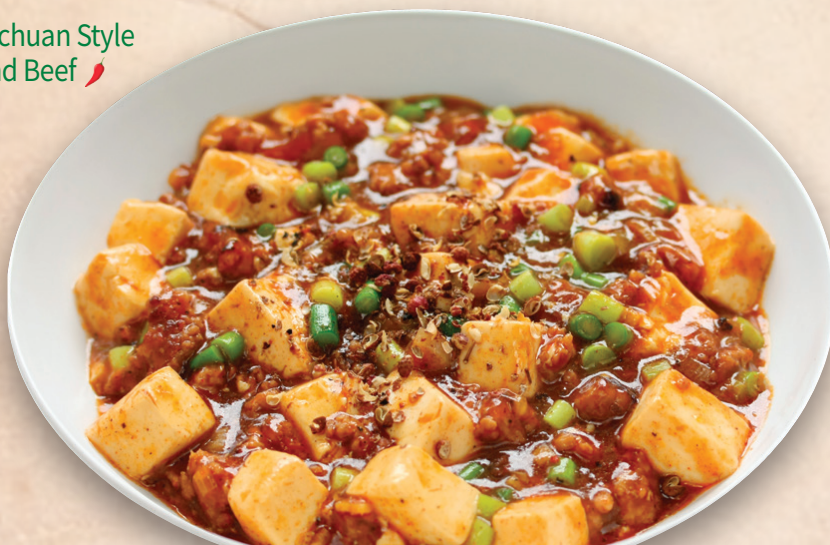
Tofu Szechuan Style w/Ground Beef