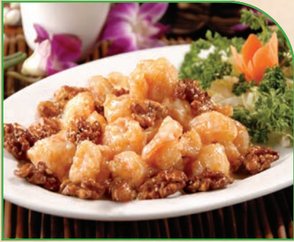
西汁合桃蝦 Shrimp w/Honey Glazed Walnuts $24.95