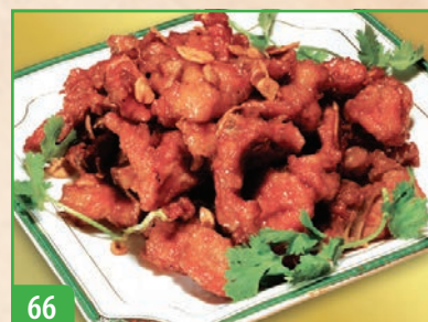
Pork Chop w/Spicy Salt