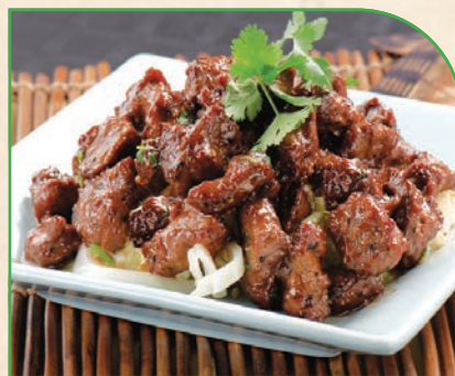
法式牛柳 Beef Steak w/Honey Garlic & Black Pepper Sauce $24.95