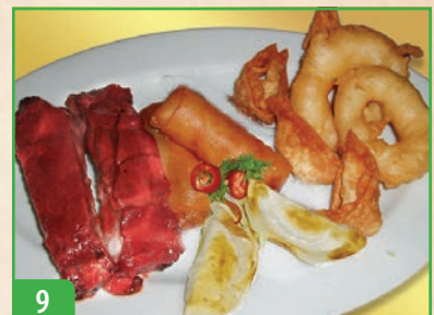
9 Pu Pu Platter