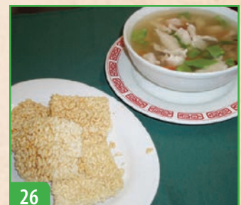
26 Three Flavor Sizzling Rice Soup