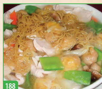
188 Wonton Noodles in Soup