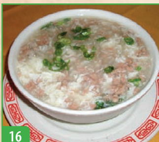
16 West Lake Style Beef Soup