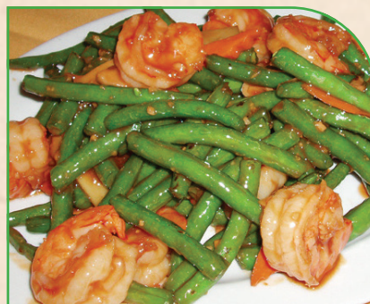
蝦球四季豆 Sautéed Shrimp and Fresh String Beans, Garlic w/Brown Flavor Sauce $24.95