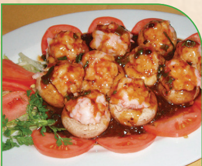
釀蝦菇 Mushroom Stuffed w/Shrimp in Black Bean Sauce $24.95