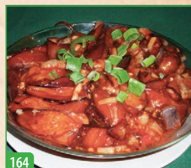
164 Eggplant w/Spicy Garlic Sauce