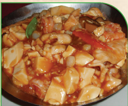
荷塘豆腐 Sparkling Chicken w/Mixed Seafood & Tofu $19.95