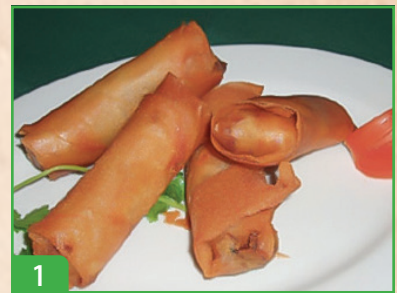
1 Vegetable Egg Roll