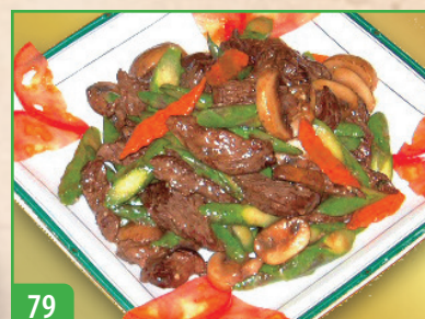
Beef w/American Broccoli or Chinese Broccoli