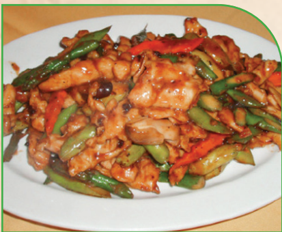
魚香利筍雞 Chicken & Asparagus w/Spicy Garlic Flavor Sauce 🌶️ $20.95