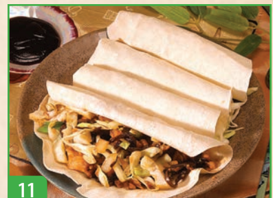
11 Mo Shu Pork