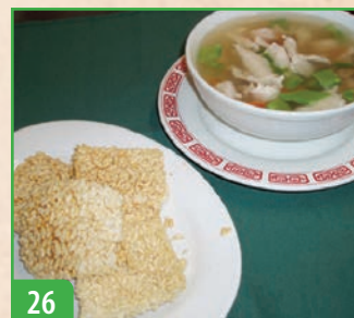
26 Three Flavor Sizzling Rice Soup