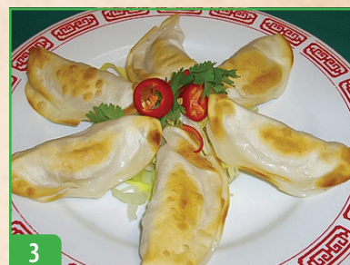
3 Pan Fried Dumpling