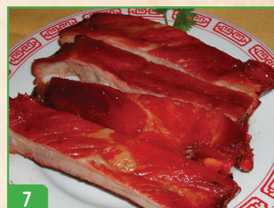
7 B.B.Q. Spareribs