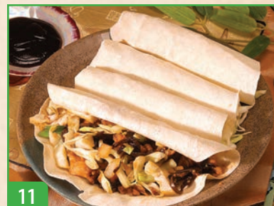
11 Mo Shu Pork