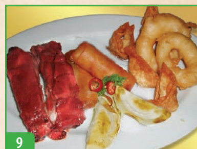
9 Pu Pu Platter