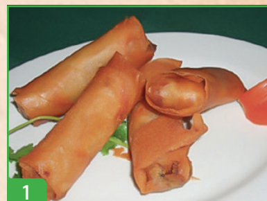
1 Vegetable Egg Roll